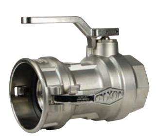
coupler x 3" female NPT